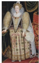
Queen Elizabeth I