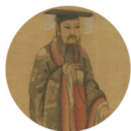
First Shang ruler King Tang comes to power