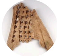
First Chinese writing in form of characters on oracle bones