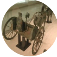
Chariots start to be used in battles