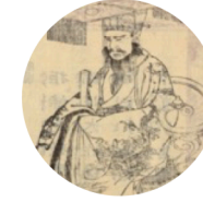
End of Shang dynasty caused by bad behaviour of Di Xin. Land taken over by Zhou dynasty,