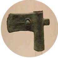
Bronze objects start to be made such as axes and vessels for ceremonies